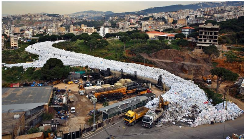
(fig.1) A snake of garbage covering the hills of Beirut

In 2015, the streets of Beirut, the Lebanese capital, started piling up with trash due to the failure of the government and the private companies to collect the trash from the homes of citizens as well as the dumpsters. This created a global environmental issue known as the “Lebanese Trash Crisis”. The image of Beirut’s streets as well as the smell that became a part of every Lebanese citizen’s life, led to a series of demonstrations by activists under the slogan #YouStink. The activists believed that the crisis was a result of the government’s neglecting performance over the years and its failure to create a long-term plan for an ecological problem that might affect Lebanon as a country and the Earth as a whole.