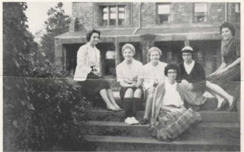
"Beanied" Freshmen meet with Junior Sisters

Since the establishment of Salve Regina, there has never been a Freshman enrollment so large.