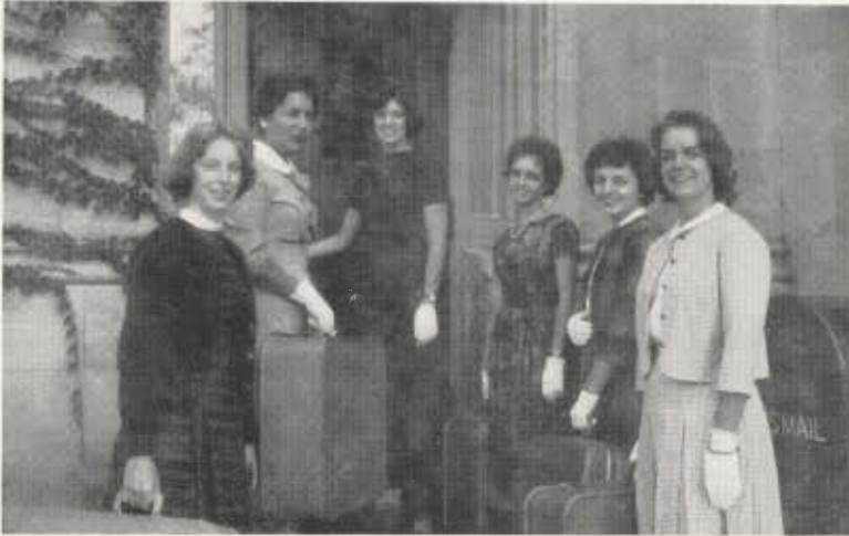
Smiling Freshmen arrive at Salve.

Salve Regina opened its doors to 160 Freshmen on Sunday, September 17. The new additions to the campus, otherwise known as the Class of '65 are residing in Ochre Court, Mercy Hall and McAuley Hall.