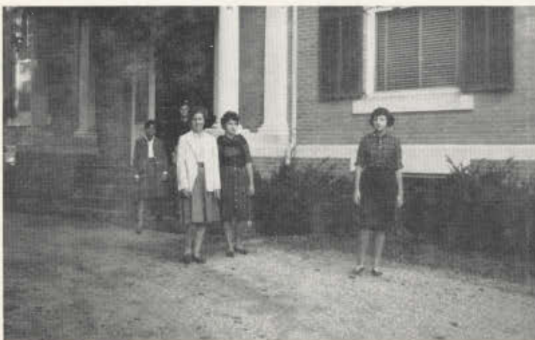
Juniors at home at St. Joseph's

Salve has added another new building to its rapidly growing campus. St. Joseph Hall, located on Bellevue Avenue, has been leased for this school year. The building is of beige brick and is furnished in a colonial style. It has a circular drive and a porte-cochere and is