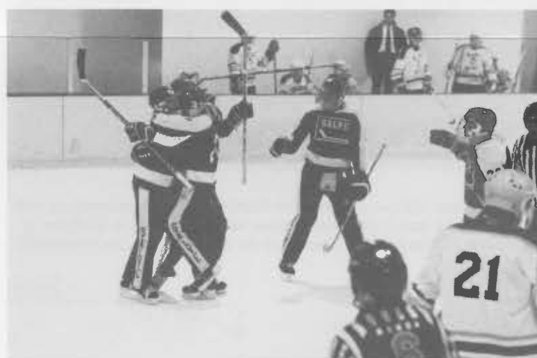
Salve Regina College recently hosted the Northeast Collegiate Hockey Association Division II Tournament. The College team went into the competition with a 10-1 record and, after an exciting win over Springfield in double overtime, went on to the finals. Salve Regina's 7-3 win over Central Connecticut State University secured the Championship.