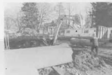
Work proceeds at the new library site.