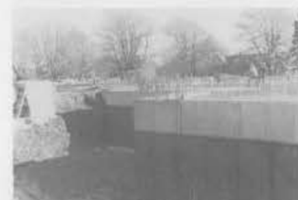
The foundation for the new library takes shape.