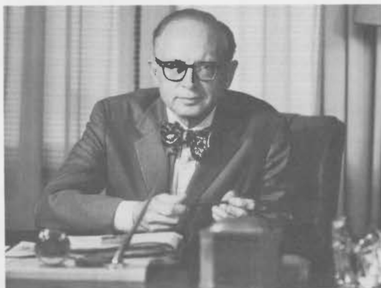
Dr. Daniel J. Boorstin.

Dr. Daniel J. Boorstin, also an educator, author and Librarian of Congress Emeritus, will discuss "The Meanings of America" at the lecture. Well-versed on the subject, the Harvard professor has written 14 history books which have received numerous awards, among them the Pulitzer Prize. For example, the trilogy The Americans: The Colonial Experience (1958) won the Bancroft Prize; The Americans: The National Experience (1965) won the Parkman Prize; and The Americans: The Democratic Experience (1973) won the Pulitzer Prize and the Dexter Prize and was a Book of the Month Club Main Selection.