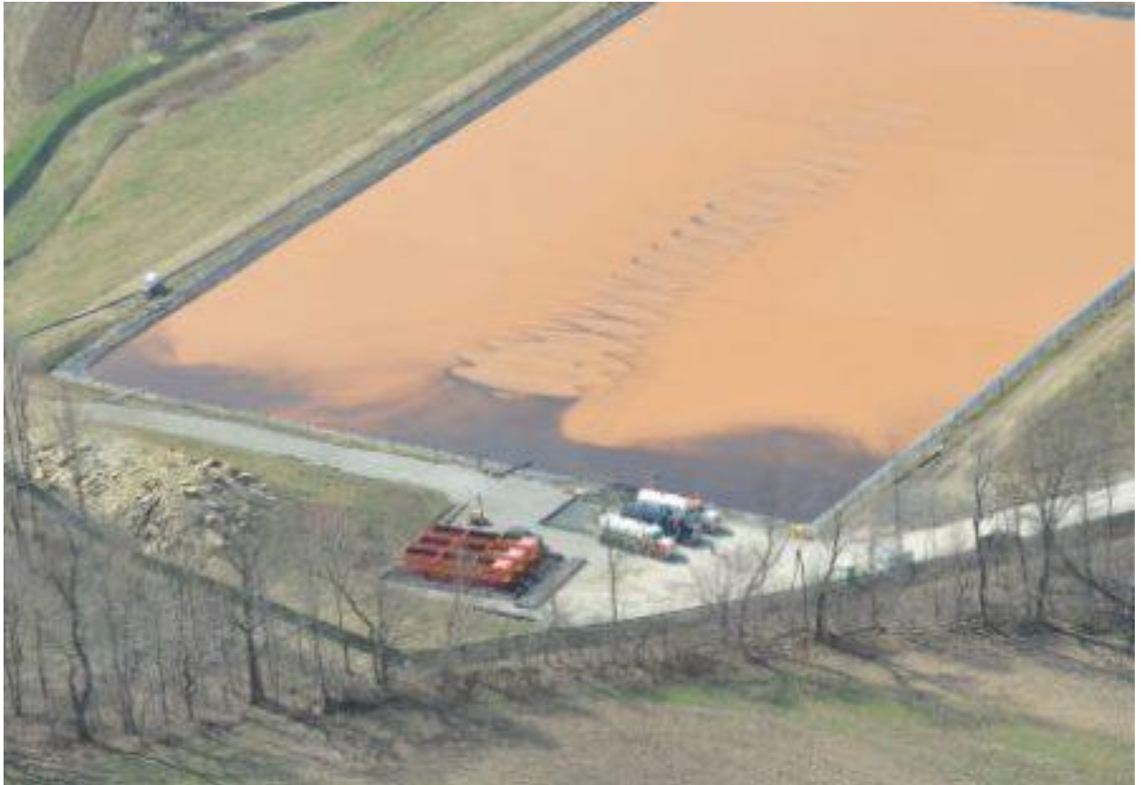
Gillooly, Amanda. "Marcellus Monitor." Marcellus Monitor. 2016. Accessed April 15, 2016. https://marcellusmonitor.wordpress.com/tag/john-day-impoundment/ .

Pictured is an 'impoundment', a pool that contains the left over fracking fluid. Millions of gallons of water will sit here wasted and unusable due to the high density of chemicals.