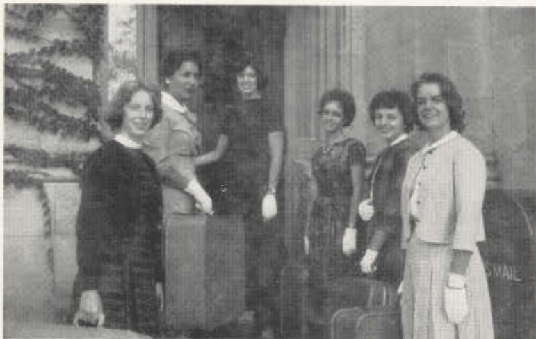
Smiling Freshmen arrive at Salve.

Salve Regina opened its doors to 160 Freshmen on Sunday, September 17. The new additions to the campus, otherwise known as the Class of '65 are residing in Ochre Court, Mercy Hall and McAuley Hall.