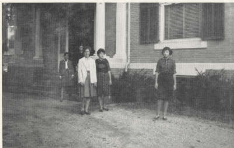
Juniors at home at St. Joseph's

Salve has added another new building to its rapidly growing campus. St. Joseph Hall, located on Bellevue Avenue, has been leased for this school year. The building is of beige brick and is furnished in a colonial style. It has a circular drive and a porte-cochere and is