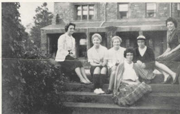
"Beanied" Freshmen meet with Junior Sisters

Since the establishment of Salve Regina, there has never been a Freshman enrollment so large.