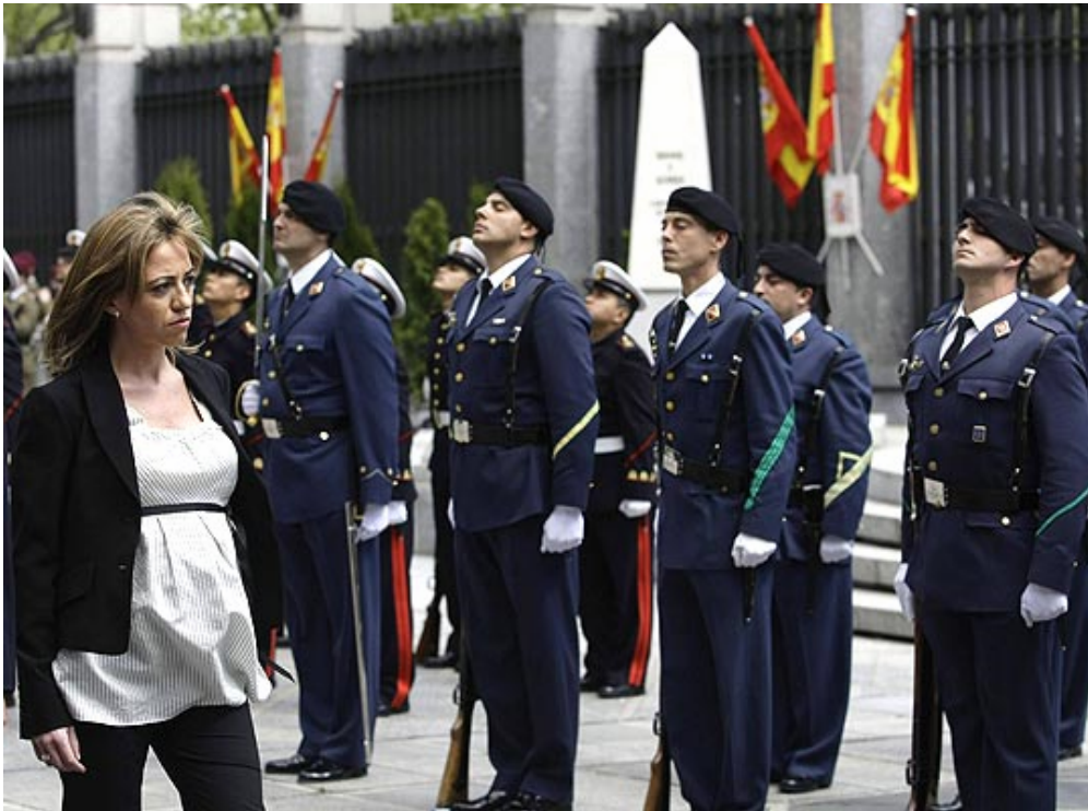
Photo 1. The minister mother: Chacón inspecting the troops. Madrid, April 2008