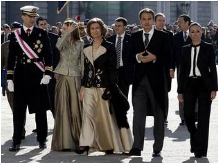
Photo 2. The hybridly-gendered minister/commander-in-chief (right). Women and men at the ceremony (Military Christmas), presided over by the King and Queen of Spain. January 2009