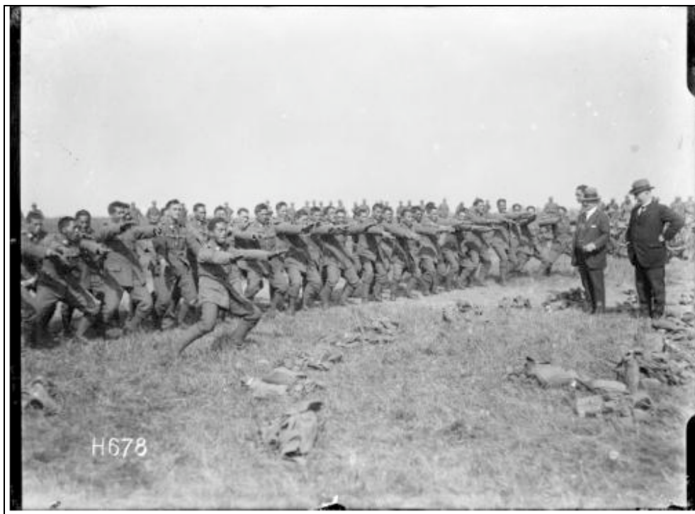
New Zealand History Online. "Maori Pioneer Battalion haka 1918."