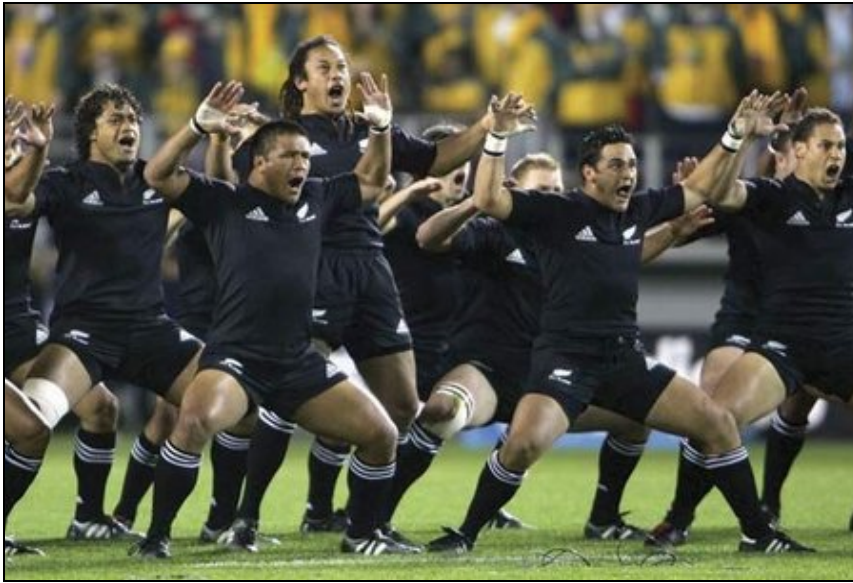
“New Zealand Rugby Team performing their own interpretation of the Haka.”