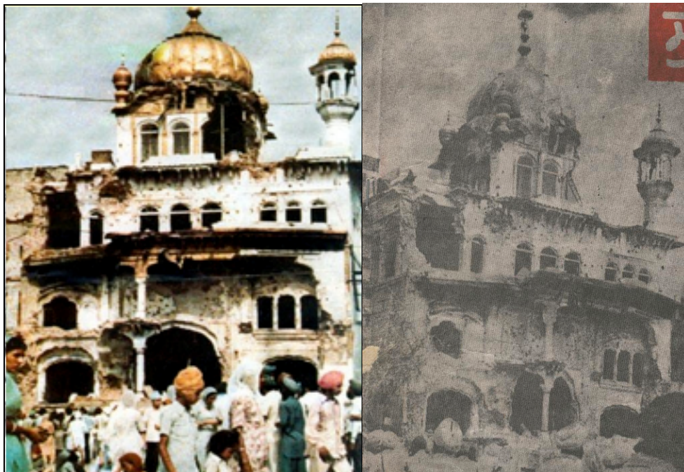
"Destruction of the Golden Temple, 1984." Photo and drawing.. http://www.sikhtimes.com/blue_star_akal_takht.jpg

Major structural damage occurred to the Golden Temple again in 1984. During the bloody conflict known as Operation Blue Star, a group of separatist Sikhs declared the desire for their own autonomy in Punjab, similar to that granted to India's Muslim-majority state, Kashmir. The group formed a dissenting sect of Sikhism known as the Damdami Taksal. The leader of the Damdami Taksal, Sant Jarnail Singh Bhindranwale, advocated a pure Punjab region exclusive to his division of Khalsa Sikhs. With the Taksal claiming to hold the rightful form of Sikhism, violence broke out in 1983, ignoring the peaceful circumstances established previously. The Prime Minister at the time, Indira Gandhi, ordered Bhindranwale's arrest out of fear. In turn, Bhindranwale hid inside the walls of the Golden Temple and took several Hindus hostage. On June 4, 1984, the Indian army attacked the Golden Temple complex. The event resulted in the death of 492 terrorists and 83 army soldiers. The Temple suffered massive structural damage in the façade and dome, the result of heavy militia and artillery tanks.