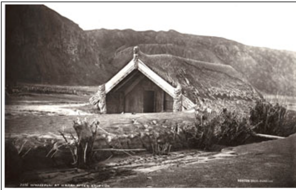
The National Trust. “Hinemihi at Te Wairoa, after the volcanic eruption.”

As Mount Tarawera spouted smoldering flames, New Zealand was on the brink of becoming a dominion, rather than a colony, of the British Empire. As a dominion, New Zealand was now a self-governing commonwealth part of a community of nations under the British Empire. The parliament of New Zealand thus enacted the Land Settlements Act, in which confiscations of land were justified by a perceived but not actual act of “Maori rebellion.” Attempts to correct unlawful seizures were settled under the compensation court, which heard the claims of the Maori. Previously, Maori claims were brought to the governors installed by British parliament. The political act of creating the Dominion of New Zealand demonstrated the slow removal of England’s influences, but not the Empire, of the English flag.