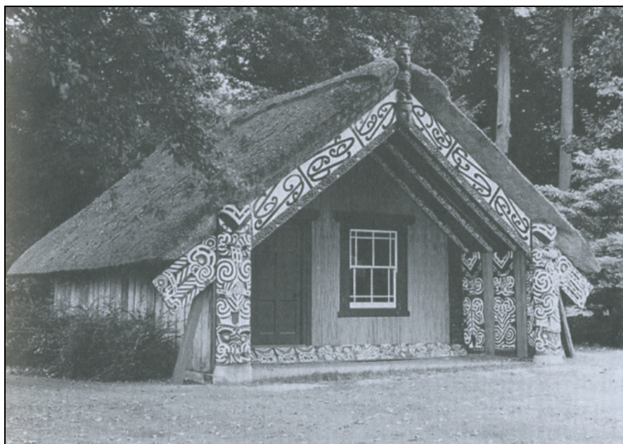
"Hinemihi 1980."