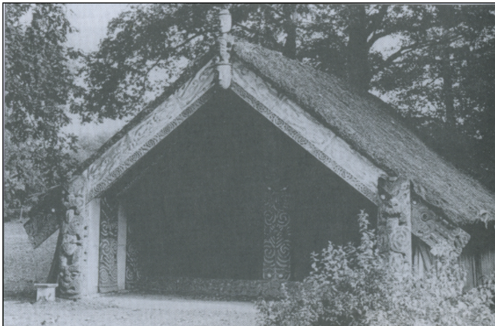
Sully, Dean. "Hinemihi, 1975."

supply of totara timber for the ridgepole, wall slabs and rafters. The building firm currently employed in the restoration of Clandon Park, Cummings, was given the task of bringing Hinemihi back to life. The firm chose KA Webster, an expert in Maori art, to advise. Hinemihi then received new heke (rafters) and a tahuhu (ridgepole). The consequences of this conservation effort, even though preformed in consultation with New Zealand, included an inaccurate placement of the carvings and the addition of a thatched roof. This damage was the result of a misinterpretation of a photograph. What appeared to be thatch in the picture had, in fact, been layers of volcanic ash that had accumulated on the reed roof after the eruption. Similarly, Hinemihi was left naked, without her front wall.