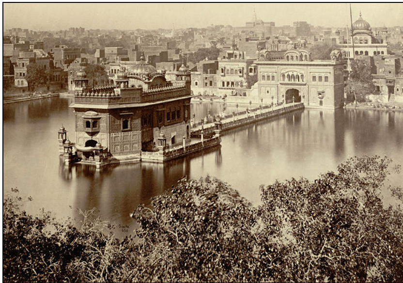
Edward, John. "The Golden Temple, 1870." Photo. http://www.unp.co .

The second restoration of the Golden Temple occurred during the entry of the British into India, as the Mughal Empire was slowly fading away. As India rose to become the Jewel in the Crown of the Empire, the territory itself became the battleground of invading Afghan forces. In 1761, a restoration of the Golden Temple occurred after Jassa Singh Ahluwalia defeated these Afghani forces in Amritsar (Times of India). There is little or no documented evidence to suggest which parts were rebuilt. However, a photo taken in 1870 shows the building in full standing form, with its golden domes and chattris. By 1858, England remained victorious over the aged and dying Mughal Empire, and the period of colonialism thus began (Wolpert, 41 – 63).