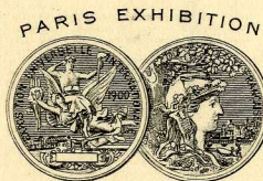
FOR PATENT HUNTING STOCKS & ANNULAR SPRING BRACES 1900.

608, Fifth Avenue, New York City, U.S.A.