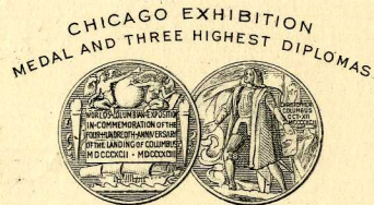
FOR SHIRTS, UNDERCLOTHING, CRAVATS ETC. 1893.

5% INTEREST CHARGED ON OVERDUE ACCOUNTS.