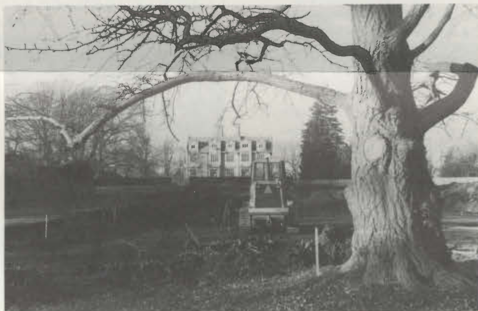
Nestled near the periphery of the new library site, a stately tree frames Wakehurst (far background). The library will echo Wakehurst's Elizabethan lines and will house up to 230,000 volumes.