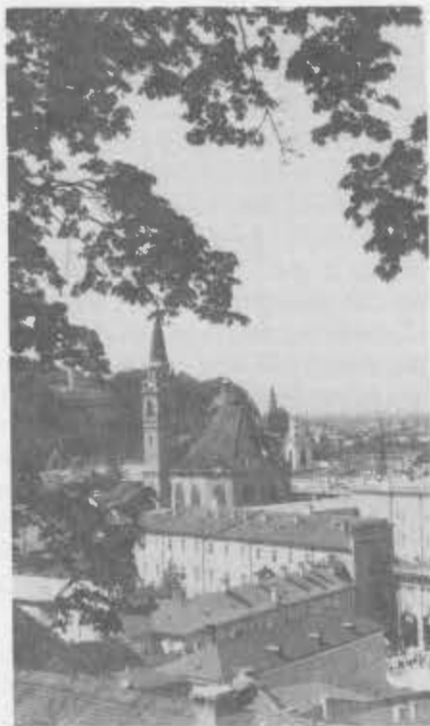
"Old Salzburg City," Salzburg, Austria.