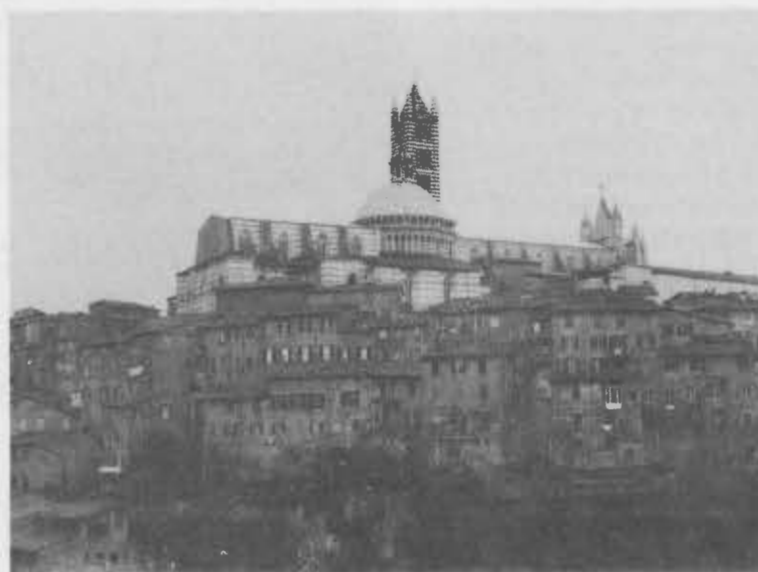
"Il Duomo," Siena, Italy.