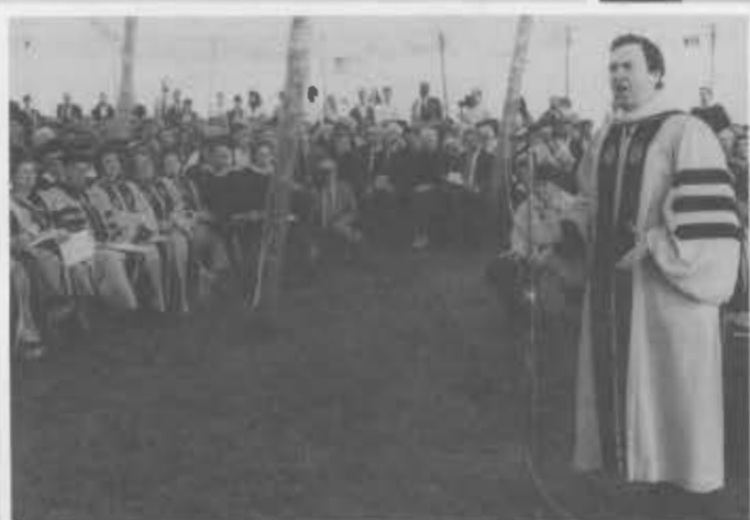
Tenor Frank Patterson provides musical inspiration as he sings an Irish ballad.