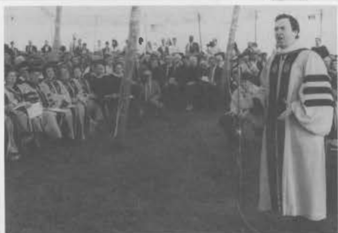
Tenor Frank Patterson provides musical inspiration as he sings an Irish ballad.