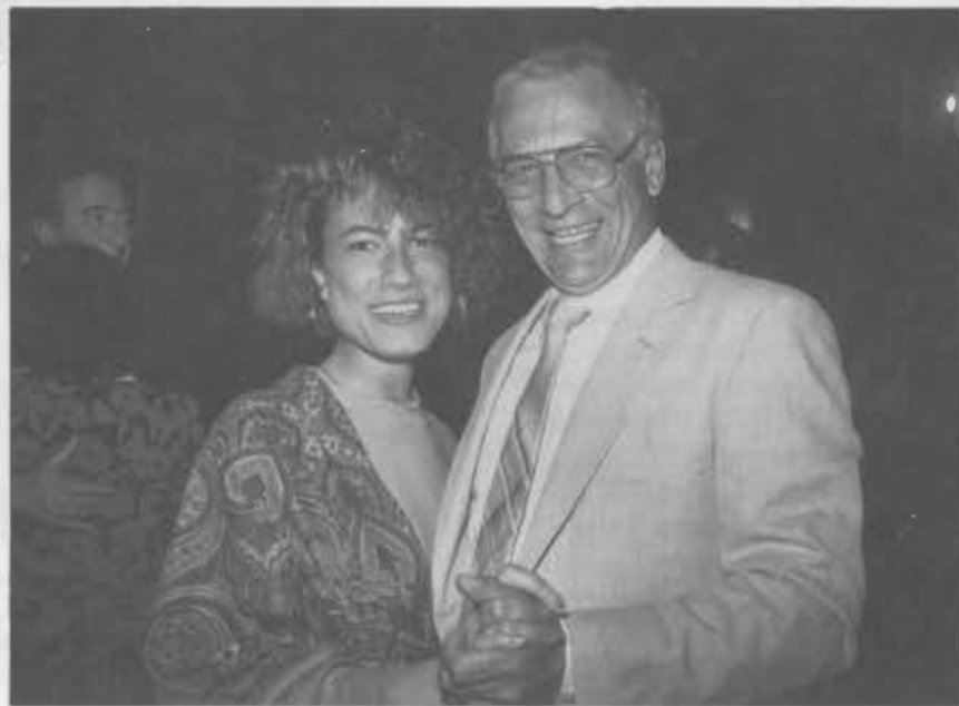
Mothers and sons and fathers and daughters take to the dance floor at the annual Parents Weekend.