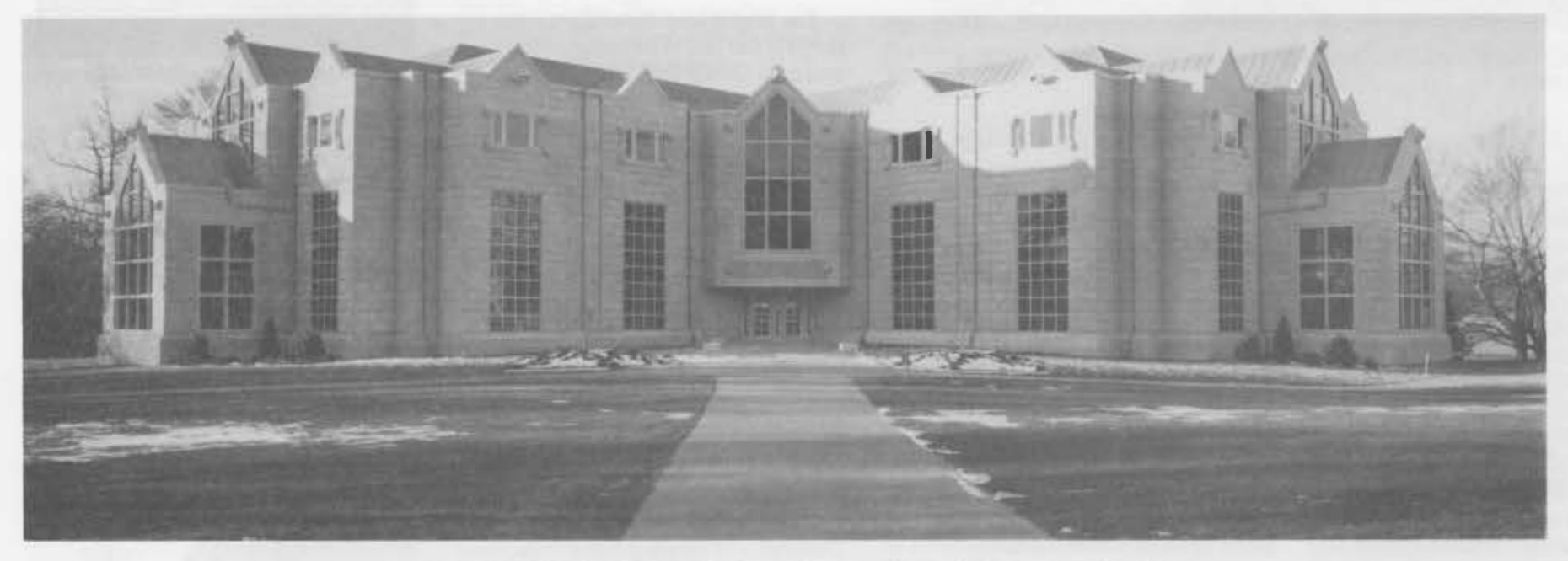
The new College Library displays its rock-face granite exterior with the peaks of its copper roof thrust toward the winter sky. Construction continues on the interior of the technologically advanced facility which is anticipated to open this year.

$1 Million Trustee and Faculty/Staff Goal Surpassed