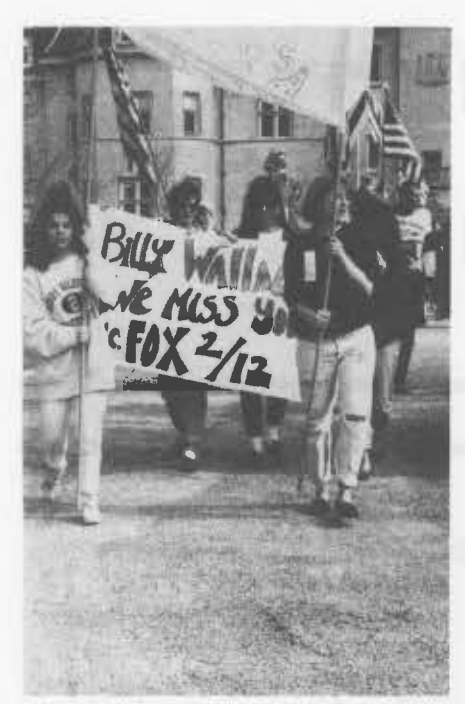
Early in February, students wore yellow ribbons, waved American flags and walked with banners to show support for the troops serving in the Persian Gulf.

Like the massive Persian Gulf oil spill creeping outward and entrapping innocent wildlife, so the war which spewed it is seeping into the hearts and minds of young students at Salve Regina College. War news spills from the TV night and day, and the reality of fathers, mothers, brothers, sisters and friends serving in the Middle East touches some students more directly. During the critical college years young adults are coming to grips with who they are, what they stand for and finding their place in the world and the cosmos. They are grappling with personal codes of ethics and enlisting their intellectual, emotional and spiritual capacities along with the wisdom of respected teachers to make their own choices. The tragedy of the war and its enormous impact on them makes it, among other things, a magnet for both their personal concerns and their emerging view of the