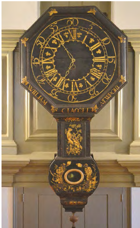
Claggett Wall Clock. During the eighteenth century, William Claggett became known as an exemplary clockmaker and a renowned Newport artisan.