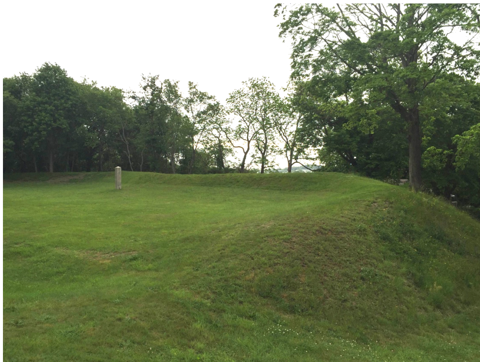
Figure PB.1 The fort on Vernon Avenue as it appears today.

The origins of this project, focusing on Middletown's role in the Rhode Island Campaign, center around a Revolutionary War era earthen fortification on Vernon Avenue in Middletown wrongly associated with the British occupation and the Siege of Newport, and misidentified as Green End Fort (Figure PB.1). The site was actually constructed as a French fort after the arrival of comte de Rochambeau in 1780. Its proximity to another fortified position on the British front lines, Card's Redoubt, had led to confusion about its origins. The misidentification fueled further historical research and scientific analysis in an effort to correct this mistake, which in turn renewed interest in the battlefield as a whole.