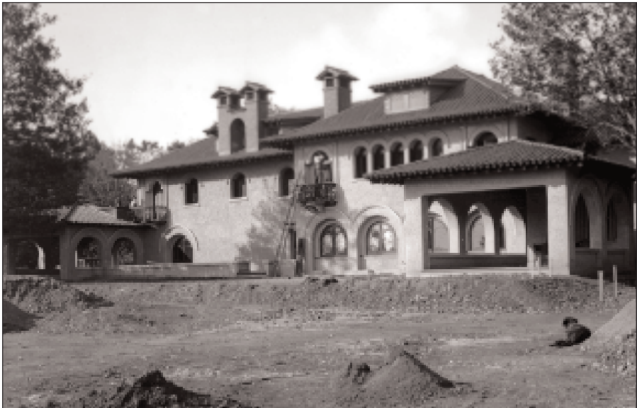
Mason House under construction, 1902