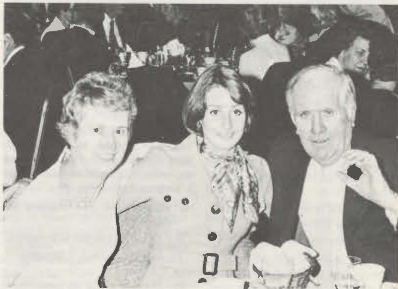
A student and her parents enjoy Parents' Weekend

The weekend concluded on Sunday morning with Mass followed by brunch in Miley Hall. As parents bade last-minute goodbyes to students with promises of seeing each other again at Thanksgiving, the Newport rain continued. Oh, back to classes, schedules, work, studying . . .