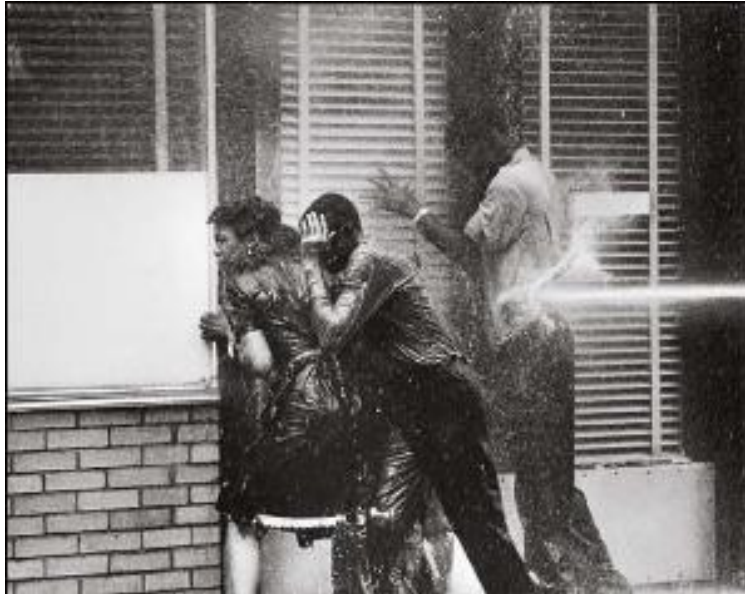
Eugene "Bull" Connor turning powerful water hoses on protestors