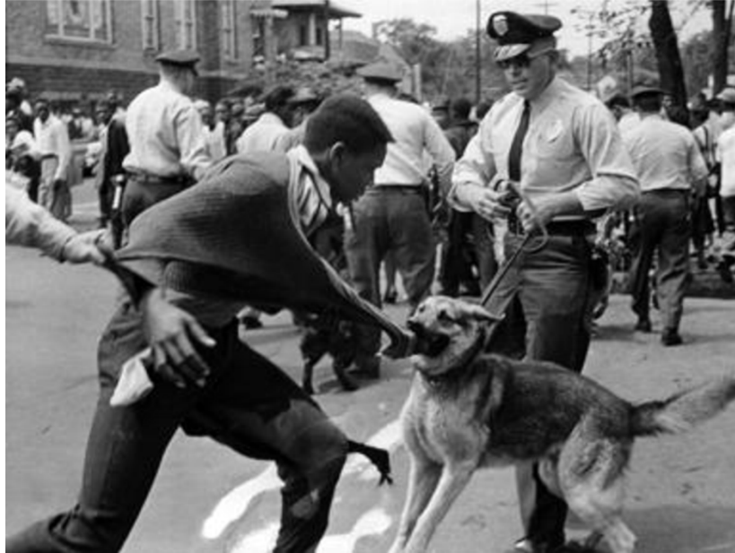
Violence displayed in the Children's Crusade