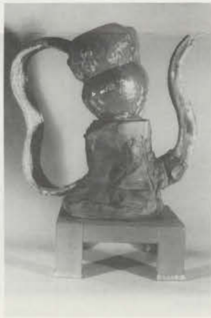
Jay Lacouture's "Ewer with Table."

The Art Department presents the annual Art Faculty Show from Jan. 23-Feb. 4, with an opening reception from 12-2 p.m. on Jan. 22, during the faculty workshop. The show will feature ceramic sculpture and vessels, graphics, mixed media construction, illustration, painting, photography and prints.