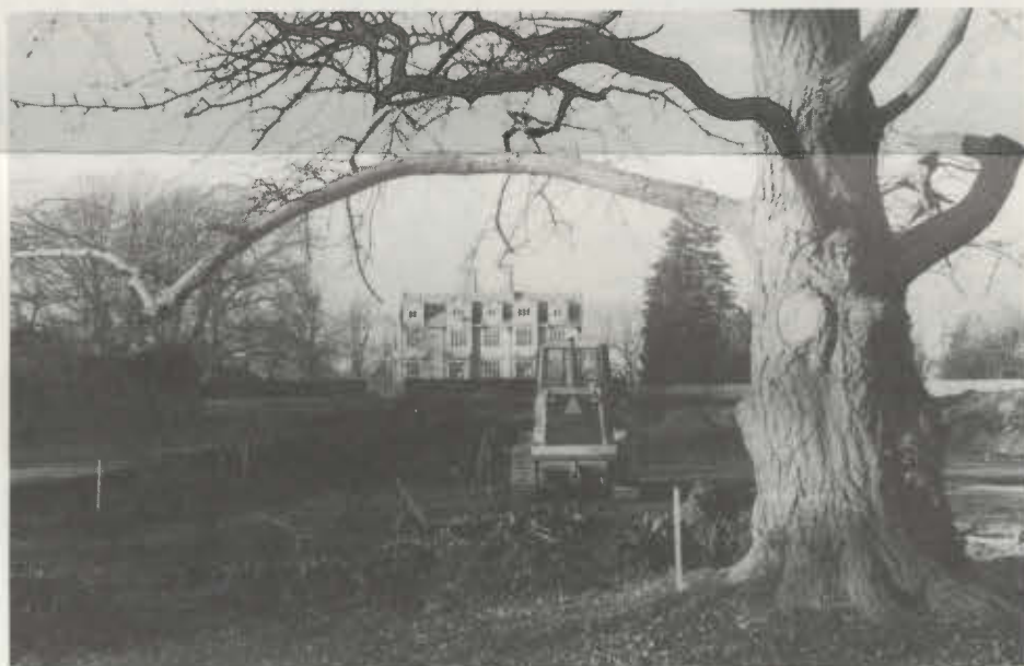
Nestled near the periphery of the new library site, a stately tree frames Wakehurst (far background). The library will echo Wakehurst's Elizabethan lines and will house up to 230,000 volumes.